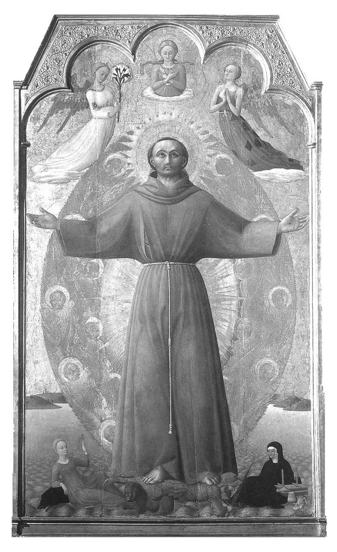
St Francis of Assisi, born 1182 - died October 3, 1226.