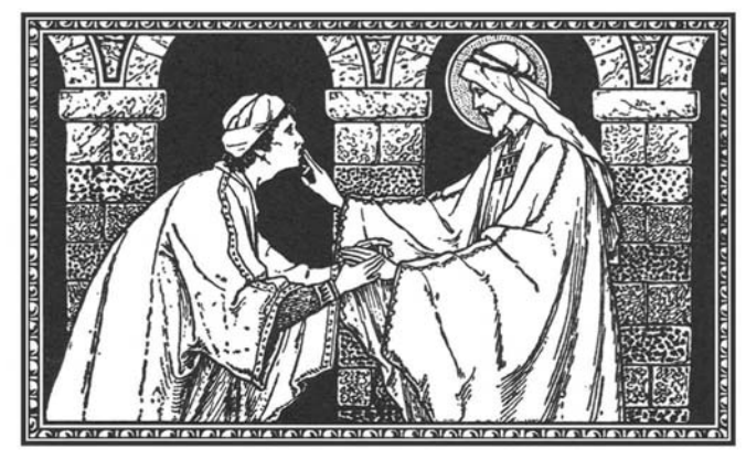
Mark 7. 31-37 GOSPEL

Alleluia, alleluia. V. Rejoice to God our helper; sing aloud to the God of Jacob; take a pleasant psalm with the harp. Alleluia.